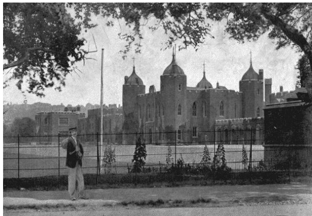
“The Shop” - The Royal Military Academy, Woolwich