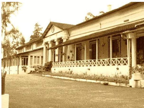
The clubhouse at Ootacamund