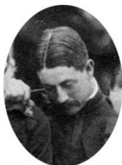
Neville Chamberlain in 1883

The game of snooker was invented by Neville Chamberlain in 1875. Everyone knows that. Or to be more precise, this is today's commonly accepted theory. But prior to 1938 there was an equally accepted theory that the game been introduced by a "Colonel Snooker" of the Royal Artillery. Then came the momentous day when Sir Neville Francis Fitzgerald